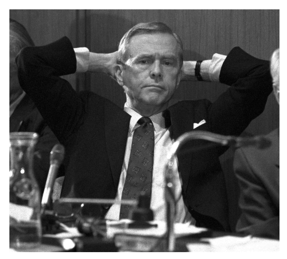
FIGURE 1. Governor Wilson listens as the Reverend Jesse Jackson speaks on affirmative action at the July 1995 Regents' meeting. Los Angeles Times, July 21, 1995, p. 1.

approved SP-1 by a margin of 14 to 10, with one abstention. Jackson and a group of protesters in the overflowing meeting room marked the moment by singing the anthem of the civil rights movement, "We Shall Overcome." The Regents decamped to another conference room to enact SP-2, 15 to 10.<sup>13</sup>