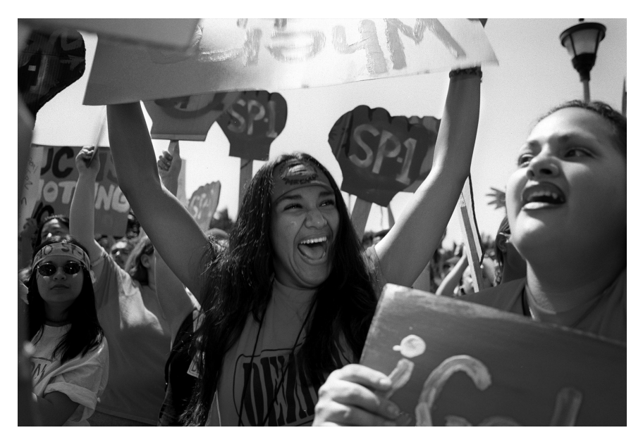
FIGURE 6. A Riverside student celebrates the Regents' decision to rescind SP-1. Los Angeles Times, May 17, 2001, p. B-1.

confirming a fall 2002 implementation date for comprehensive review—but only if the Academic Senate recommended it and the Regents approved it.<sup>5</sup>